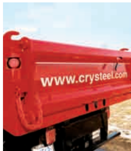
Large open area for advertising your company.