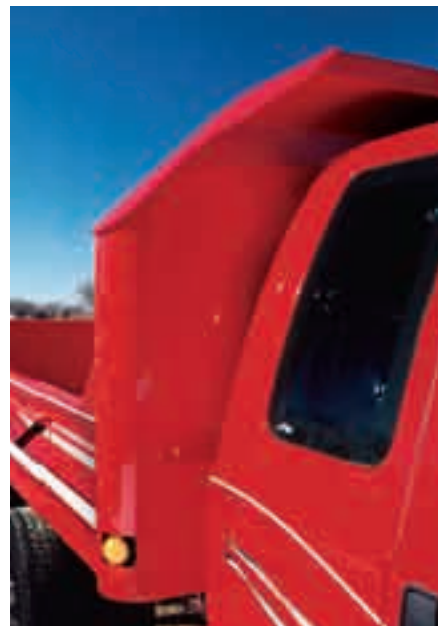
Eye catching, aerodynamic design enhances form and function.