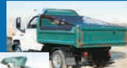
Fully integrated load cover option exemplifies convenience.