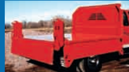
Fold down sides come with an over center latch for smooth operation.