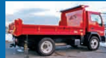
Taller fronts are available to accommodate the popular low cab forward chassis.