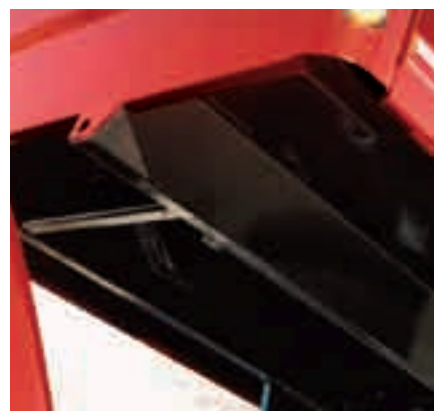
Clean understructure, less areas for rust to develop.