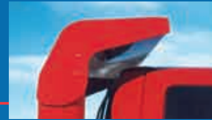
Aerodynamic contoured cabshield.