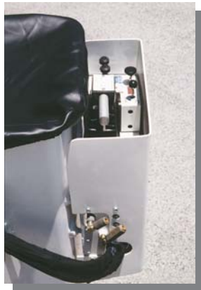
Convenient bucket controls.

TIME MANUFACTURING COMPANY P. O. Box 20368 Waco, TX 76702-0368 Tel.: 254-399-2100 Fax: 254-399-2651 www.timemfg.com