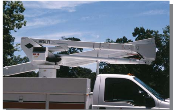
Side by side low stow boom design allows for safer platform entry and reduced travel height.

TIME MANUFACTURING COMPANY P. O. Box 20368 Waco, TX 76702-0368 Tel.: 254-399-2100 Fax: 254-399-2651 www.timemfg.com