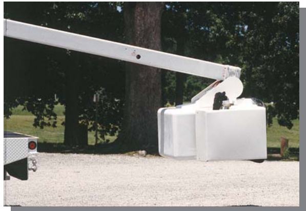
Standard features include hydraulic platform tilt for operator rescue and easy platform clean-out.