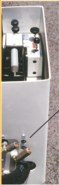
Hydraulic tool outlets